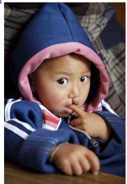
Below: A gorgeous and cold little boy waiting for surgery .