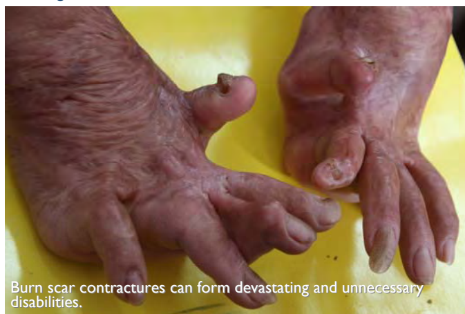
Burn scar contractures can form devastating and unnecessary disabilities.