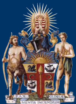
ROYAL AUSTRALASIAN COLLEGE OF SURGEONS

Interplast Australia & New Zealand is a project actively supported by Rotarians in Clubs and Districts throughout Australia and New Zealand.