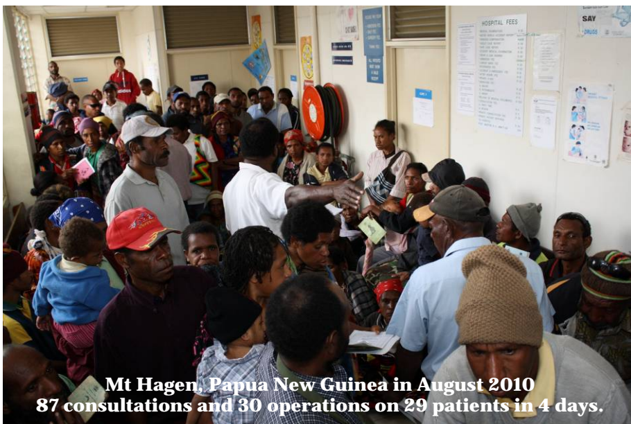
Mt Hagen, Papua New Guinea in August 2010 87 consultations and 30 operations on 29 patients in 4 days.